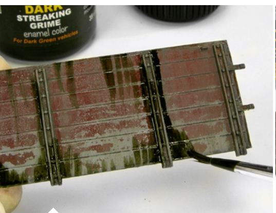
Shake the bottle and use the product to paint on lines and accumulated dirt.