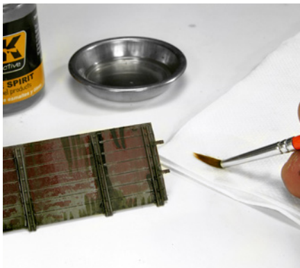
Use a clean brush and AK 011 White Spirit. Remove the excess White Spirit on a tissue or a cloth.