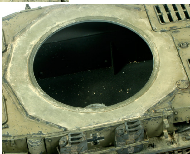
When the fixer has dried you have a realistic dusty finish. An easy technique with great results.