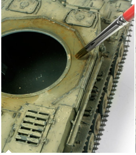
Use another clean brush and fix the pigments with White Spirit or Pigment Fixer.