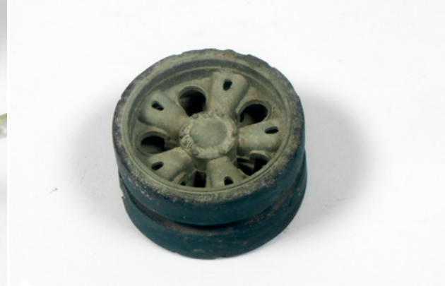
When dry the effects become visible, this wheel has now a dusty appearance with accumulated dirt in the crevices.