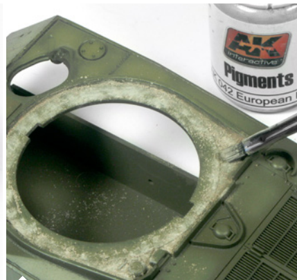
To achieve a dusty look you can brush the pigments in place. No fixer is needed although it's highly recommended.