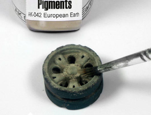
Apply the pigment with dry clean brush.