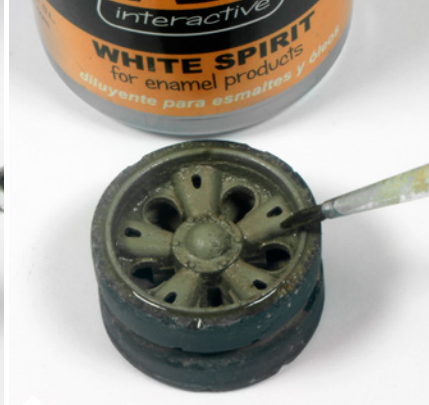
Fix them in place with some White Spirit or pigment Fixer put aside to dry thoroughly.