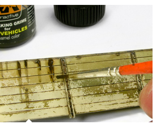
To create the effect of dirt apply the product directly from the jar with a fine brush to create streaks of drained dirt.