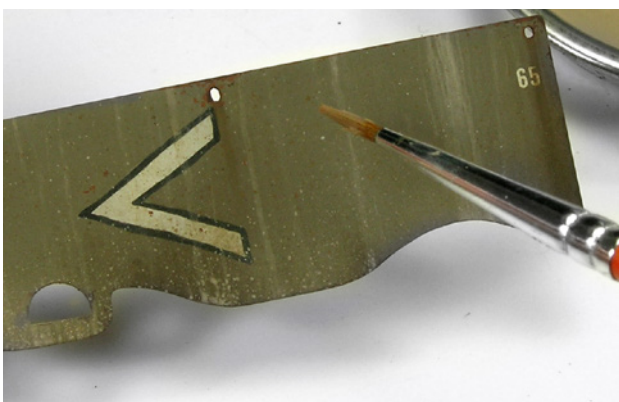
We can mix it with any other product from the same range to vary the resulting color, in this case it has been mixed with AK022 Africa Dust Effects.

Once dry, with a clean brush dipped in white spirit AK011 we will soften it sweeping the surface vertically and in both directions achieving the desired effect.