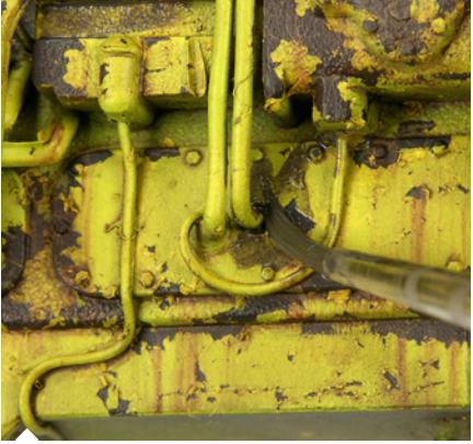
Dip the brush in White Spirit to start removing the excess and softening the parts where there should not be a high concentration of grime.