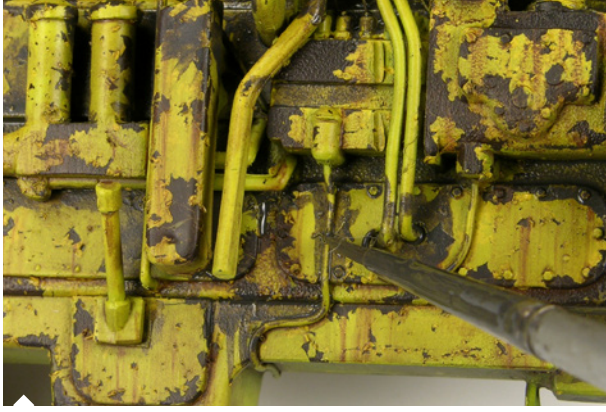
It is important to soften the edges in some parts otherwise it will not look realistic, repeat the process until you are satisfied with the result.