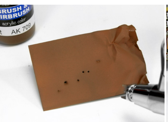
Initially give a layer of rust color to the whole piece or part of it.