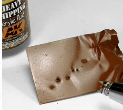
Then airbrush a pair of layers with the Heavey Chipping liquid.