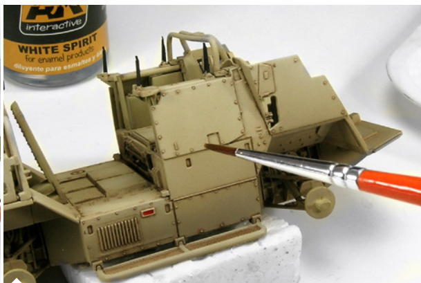
With a fine, clean brush dipped in thinner AK011 White spirit will clean the surface and removing the wash excess.