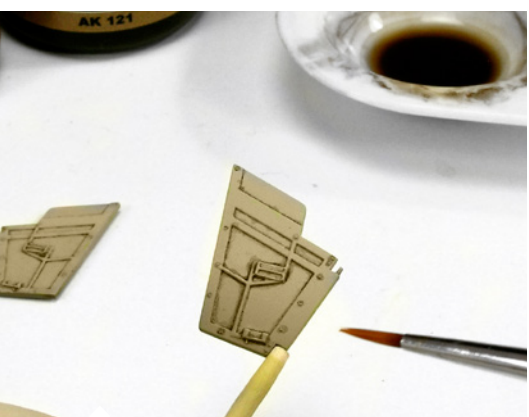
This wash is ideal for vehicles painted in light sand shades. We apply it straight from the jar in all reliefs and crannies on a glossy surface.