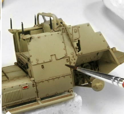
Glossy surfaces allow the wash flow better in the edges and in general around all details and reliefs and thereby achieving the proper depth.