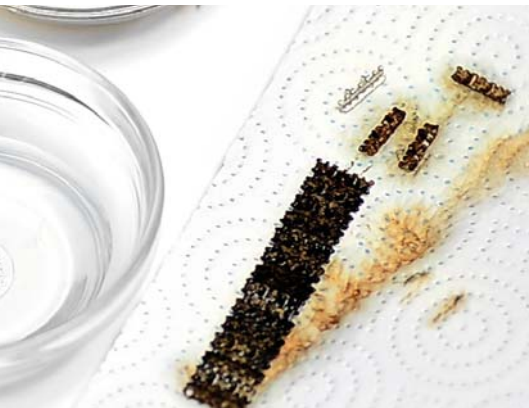
Dry it out with an absorbent paper and let the liquid react to create the rust.