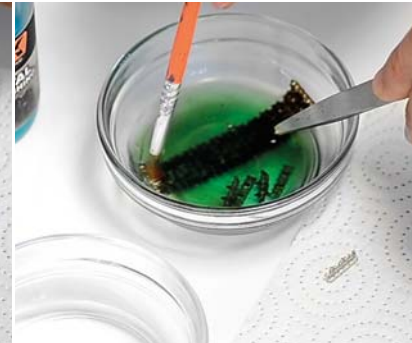
With the aid of an old brush make the liquid penetrate inside the cavities to achieve a uniform look.