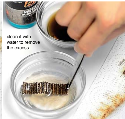
clean it with water to remove the excess.