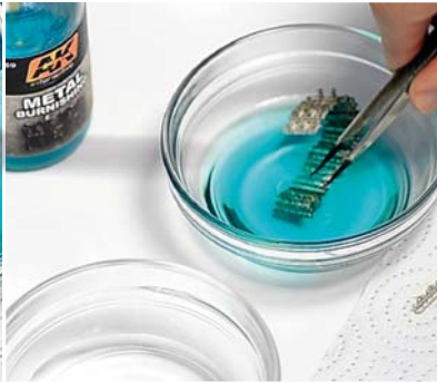
Place the tracks inside the liquid AK 159 METAL BURNISHING.