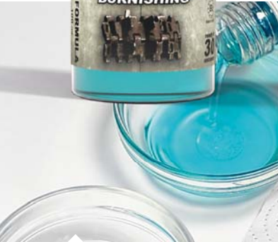
Pour the product into a container with caution. It can be diluted but this will change the reaction times

liquid for a few seconds and the metal will begin to appear dark and rusty very quickly, easily and effortlessly. You can vary the effect using different dilutions and varying lengths of soak. Using less product, you can achieve even better results than with our previous formula.