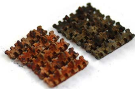
Here we can see different kinds of liquid exposure.