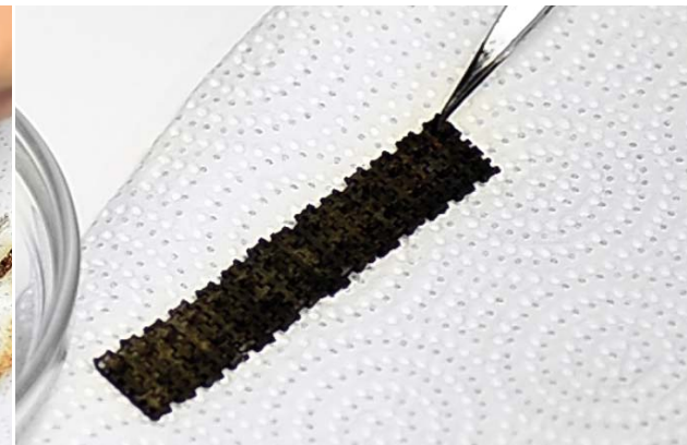
After half an hour the liquid will have finished reacting achieving the desired effects