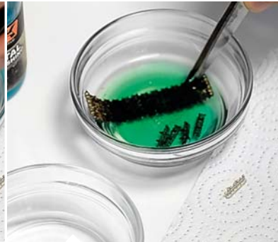
Let liquid act during some seconds inside the liquid.