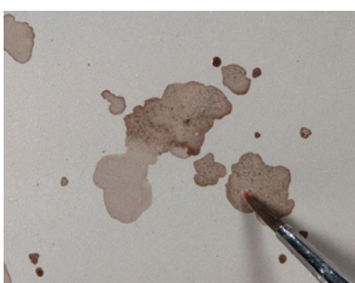
Before you start you must be sure that the surface is dry and clean for the To create older, more dry stains you can thin this product easily with White Spirit and paint optimun results on the stains

down or loose oil causing streaking and other mishaps. So if you want to copy these effects on your airplanes the 'Aircraft engine oil' is the perfect tool, just shake, and it's ready to use.