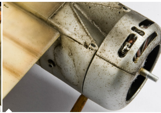
Oil splatters are easily replicated using the splatter technique. Take a brush loaded with some paint and with the airflow of the airbrush you can blow the paint on your model. Easy and with great results.