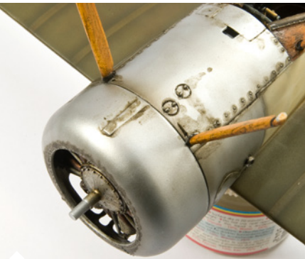
For a lighter more subtle effect you can easily thin the Aircraft engine oil with White Spirit.