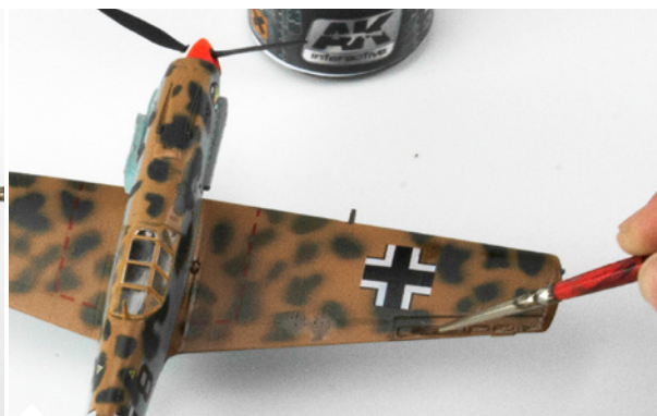
Clean of the excess with a clean brush and White Spirit.