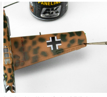
Apply the paint and let is set for about 5 till 10 minutes.