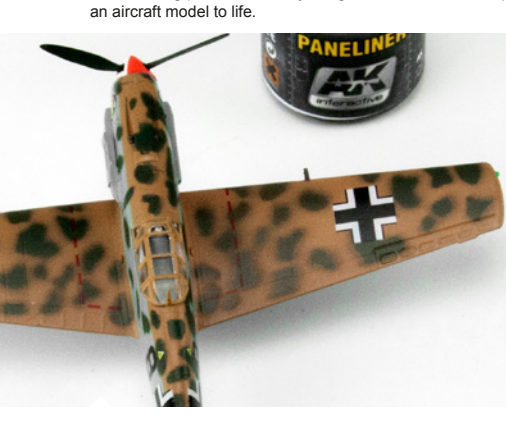
To create depth in your aircraft model accentuating panel lines is an important step, as it will change the look dramatically.