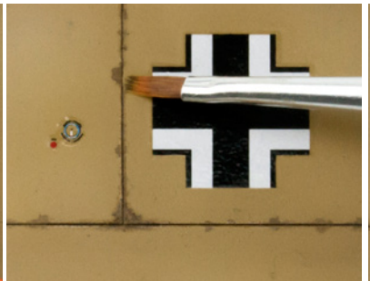
After 5 till 10 minutes clean the excess paint off with a brush moistened with White Spirit.