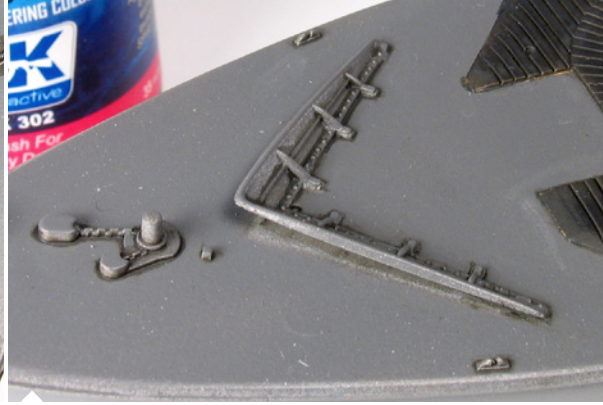
Remove the excess with White Spirit so that the darker zones match with the edges of the ship structure and assembly of the rest of the details.