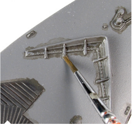
Apply the wash so that it reaches all parts of the deck, mainly the details as chains etc...