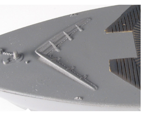
The first step is to paint the deck with the base color depending on the color of the deck and give ti a satin or glossy varnish so that the wash penetrates better the deck planks.