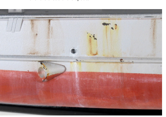
The salt not only appears on spouts but also accumulates in the lower parts of the hull next to the sea.