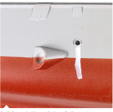
Apply the product in a vertical way fro the spout.