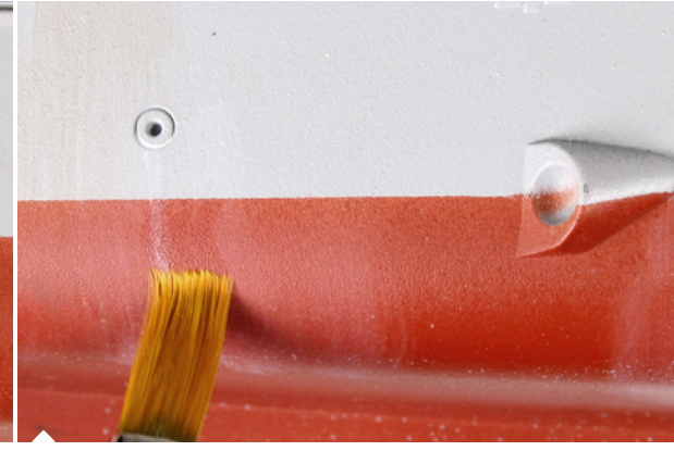
With a flat brush dipped in White Spirit start to blen and soften the stroke. Remeber the flow direction of water to achieve more realism.