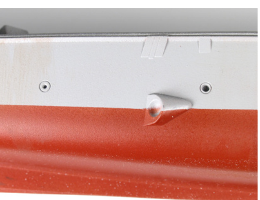
This is an essential product for all ships as this effect always appears and it is very easy to use. It is applied over the areas of the spouts.