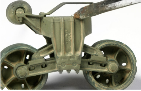
Blend in the paint with a moist flat brush. You should actually push the paint there where it needs to be. Don't forget to clean the brush frequently.