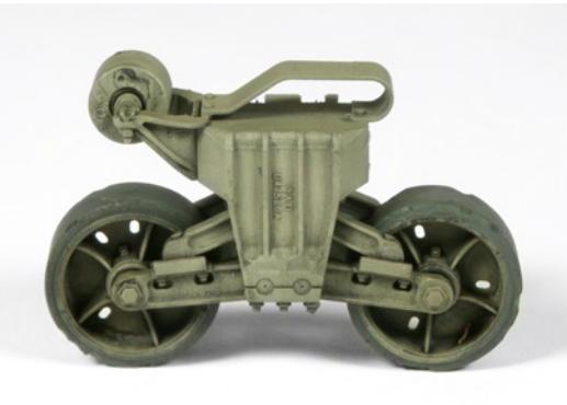
Applying the Dust & Dirt deposits will bring some color in your model