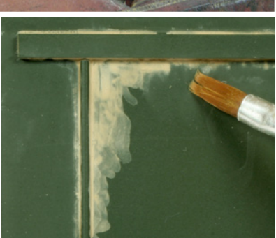
Use a flat brush moist with White Spirit and blend in the paint proximally 10 minutes after it is applied.