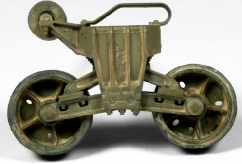
This process can be repeated until you are satisfied with the result.

It can also be used to outline the model to create dust effects around the details.