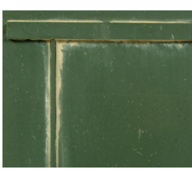
Due to the very fine texture of the paint the result is a perfect simulation of built up dust or dirt