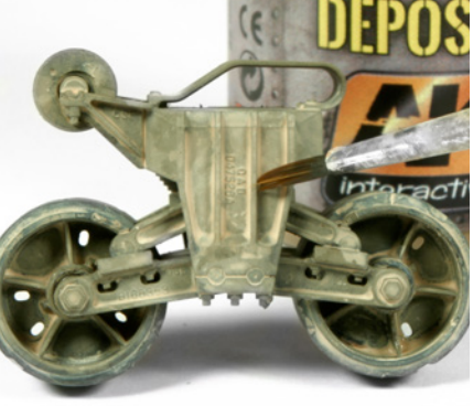
Apply the product in the desired places and let it set for about 10 minutes.