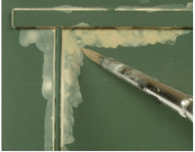
Shake before use and apply the products directly from the jar.