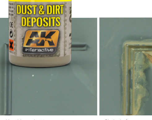
Use this product to recreate accumulated dust on your model.