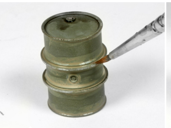
Paint on the product directly from the jar.