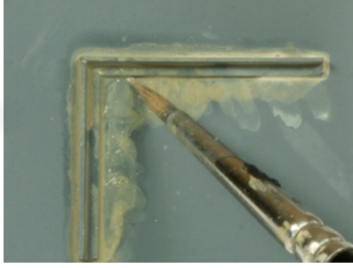
Shake before use and apply the products directly