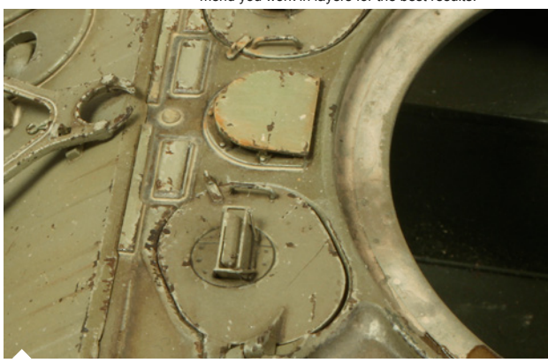
You can keep repeating this until you are happy with the effects. Make sure you allow enough drying time between each layer.

With a moist brush you actually push the paint in place, creating layers.