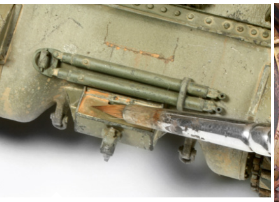
The more layers you add the stronger the effect will be