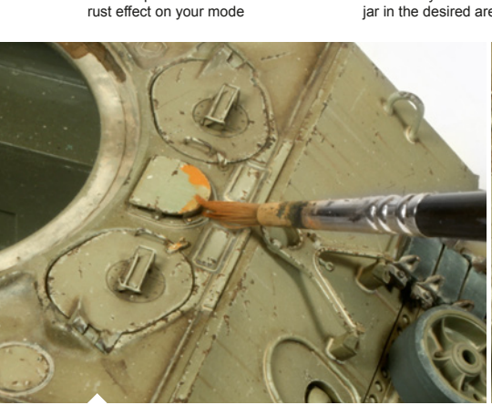
Apply the paint directly from the jar, in one or more layers on parts of your model.

Due to the very fine texture of the paint, you can achieve a realistic crusted rust effect. We recommend you work in layers for the best results.