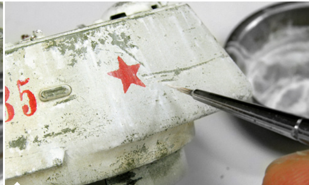
Applied with a fine brush you can get dirt streaks then proceed to shade it.