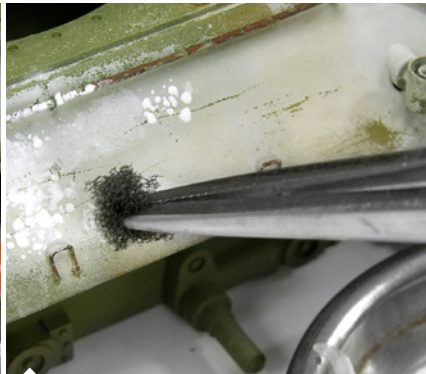
...or with the help of a sponge to create the mapping effect.