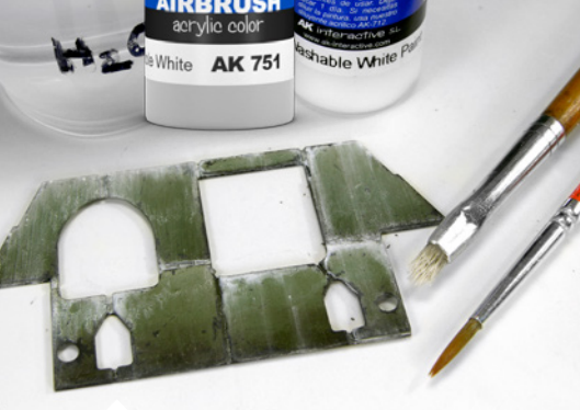
Materials needed to achieve and worn White Wash effect on armor plates.

Applied with an airbrush or brush on the primer, is perfect for winter camouflage in which we simulate the effect of white paint faded from use and weather conditions.