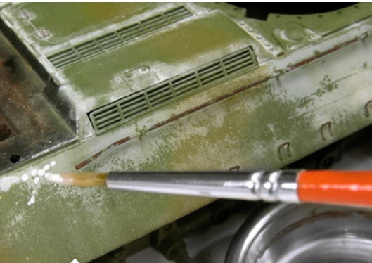
We can use a brush to apply the paint...