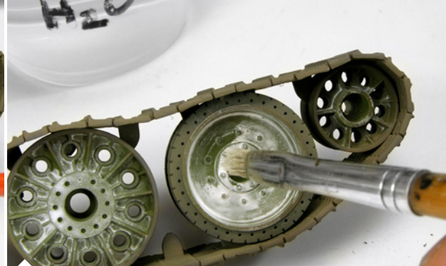
Immediately after it has dried and with the help of a stiff brush moistened with water use it on those areas where we want to get rid of white paint to reveal the base color.