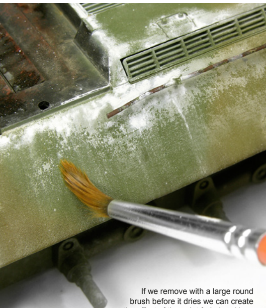
If we remove with a large round brush before it dries we can create the effect of the paint faded and how the rain withdraws it. We must be careful with the drying time because the acrylic can leave some marks and become more difficult to remove.