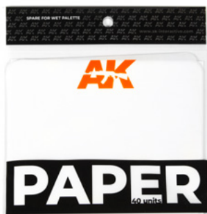
AK8074 PAPER (wet palette replacement) 40 units.