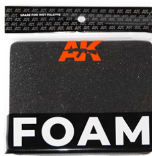
AK8075 FOAM (wet palette replacement)

There will always be spare parts available for the components of the Wet Palette, and the correct size, ready to be used.