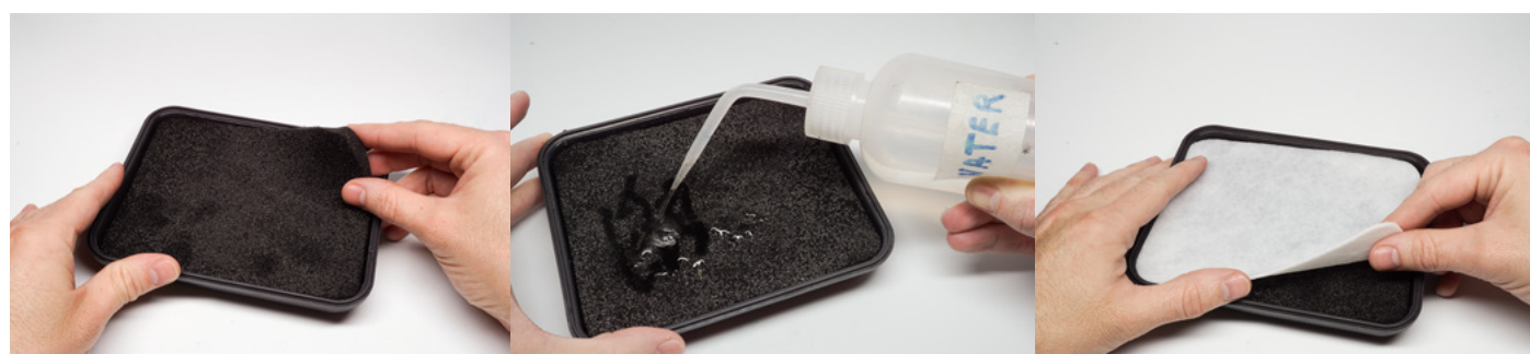
Introduce the sponge in the palette and try to make sure it has a good amount of water left.

The size of the Wet Palette is conceived to offer the largest possible working area while taking as little space as possible on the working desk. It is stable also when in motion.