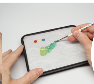
Mix the paints at your needs, and when finished leave it in the fridge for further use.