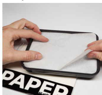
Moisten the paper with care. Place the paper centered over the wipe to cover it