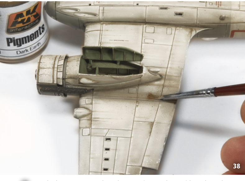
The brown soot on the exhaust stains are done with Dark Earth Pigments.