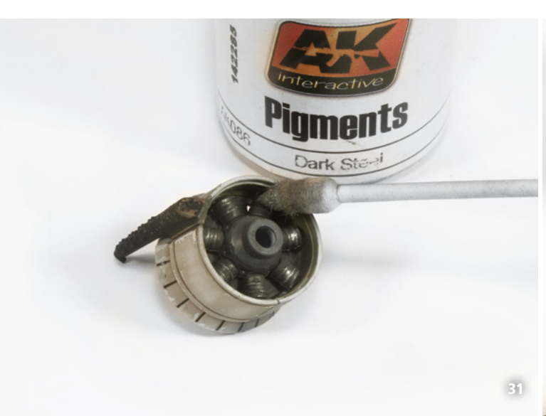
31 The cylinders of the engines are after being painted in dark grey polish with Dark steel pigment to give them a metal finish.