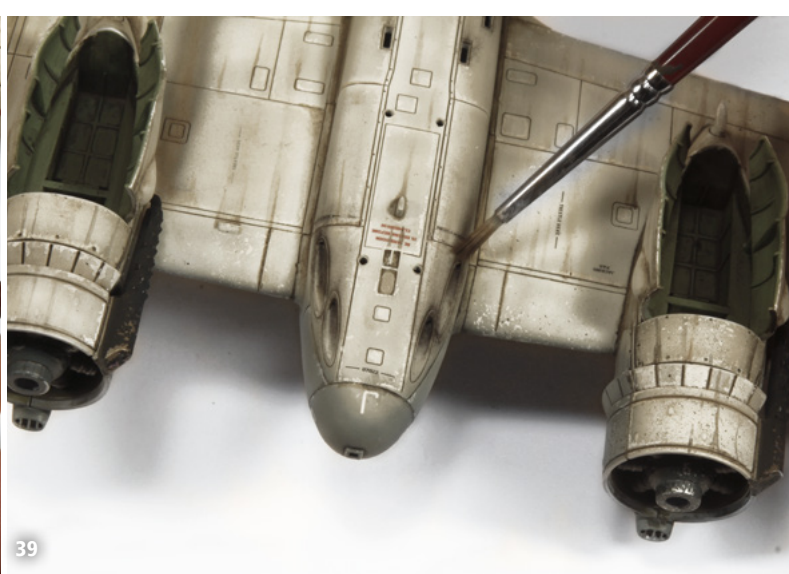
39 And the soot on the canons is done with black pigments apply dry.