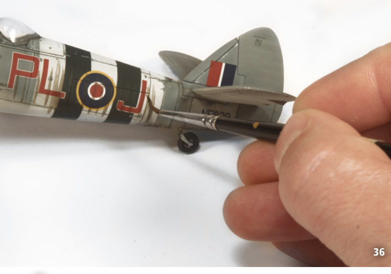
36 The same color is used to get some light streaking effects on the side of the hull. First we paint on some lines.