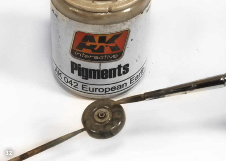
32 The wheels are given a wash mixed from Europe Earth pigments and White Spirit.