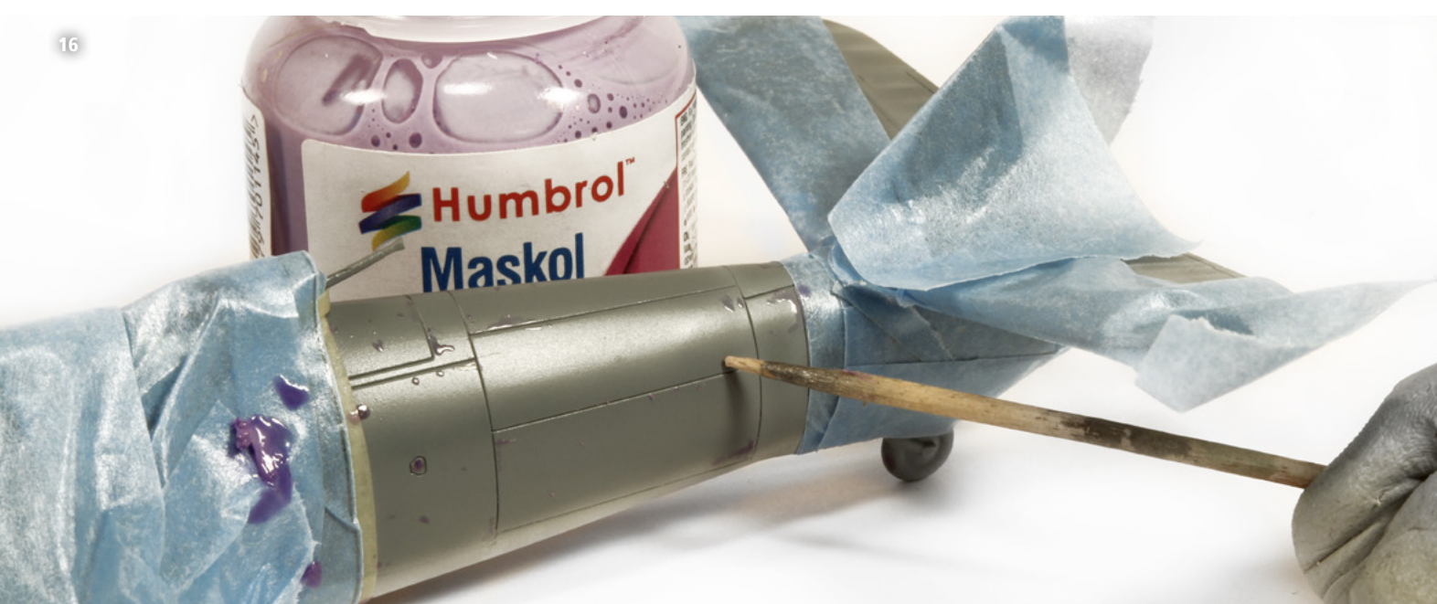
16 Before we paint on the white parts we first apply some Maskol with a toothpick. Later after painting the Maskol will be removed and we have immediately some chipping effects.

15 The masking for the D-day stripes takes up some time if you want to do it decent. Some measurements need to be taking to make sure all lines are evenly wide.