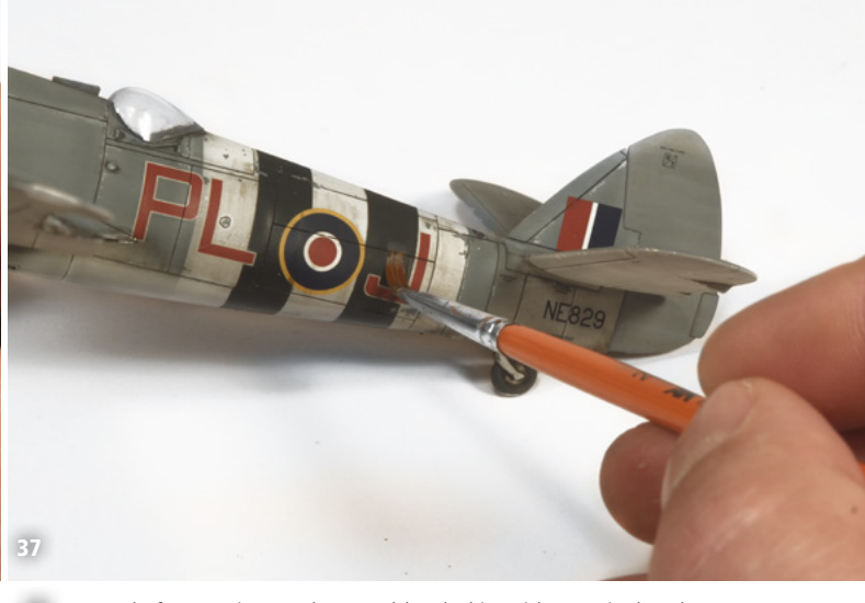
And after 5 minutes they are blended in with a moist brush.